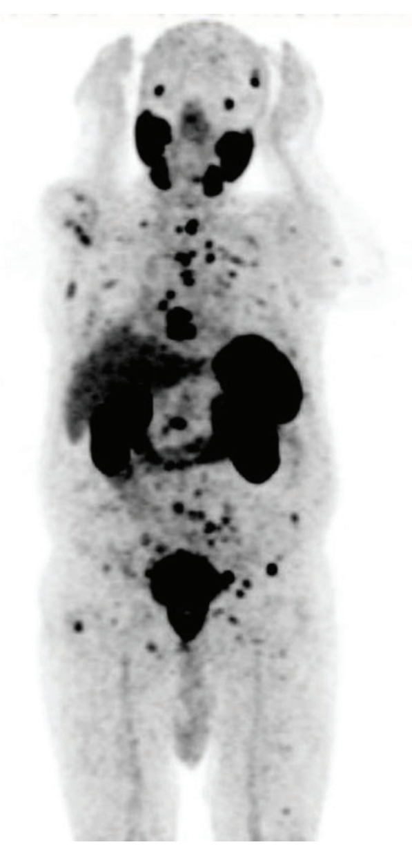
Figure 3. Maximum intensity projection image of 68Ga-PSMA PET/CT showing diffuse metastatic involvement.

PSMA: Prostate-specific membrane antigen, PET: Positron emission tomography, CT: Computed tomography