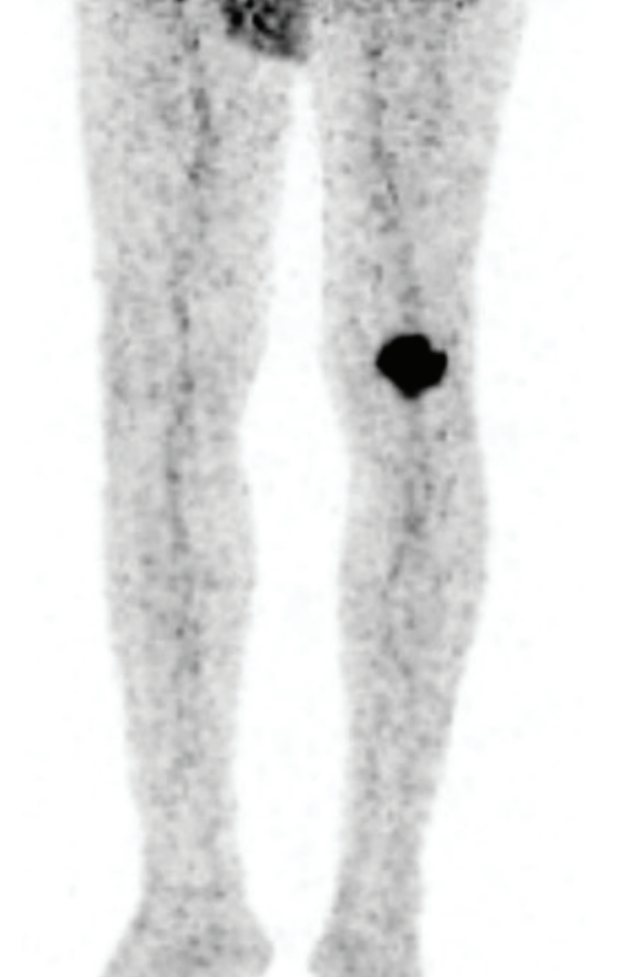
Figure 2. Maximum intensity projection image of <sup>68</sup>Ga-PSMA PET showing isolated patellar involvement not proven to be metastatic PSMA: Prostate-specific membrane antigen, PET: Positron emission tomography

Results of patients who underwent lower-extremity acquisition with the suspicion of metastasis (group 1) and as part of routine acquisition (group 2) were shown in Table 2, excluding the case with suspicious metastasis. In the 1<sup>st</sup> group consisting of 46 cases, lower-extremity metastasis was detected in 14 patients (31.11%), whereas in the 2<sup>nd</sup> group consisting of 13 patients, only one case (7.69%) was detected with lower-extremity metastasis. No statistically significant difference was found between these two groups (p>0.04).