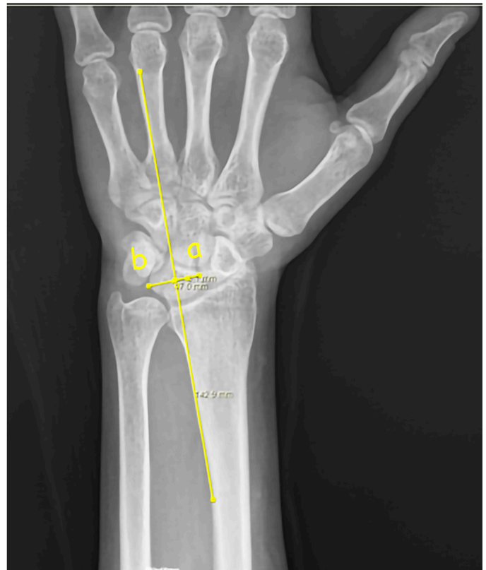
Figure 1. Radial translation value calculation: [a / (a+b)] \times 100

All radiographs were evaluated by 3 observers. To determine the inter-observer agreement of the measurements obtained from the same point, the intraclass correlation coefficients (ICC) were calculated. The mean right and left measurements in the dependent groups and whether or not the differences between them were statistically significant were analyzed using the t-test. The significance of the difference between the right and left measurements in repeated measurements was examined by variance analysis. In the independent groups of variables, the difference between the mean values according to the groups was examined with the t-test. Categorical variables were analyzed using the chi-square test. The obtained data were statistically analyzed using SPSS vn. 20.0 software. The results were stated in a 95% confidence interval. A value of p < 0.05 was accepted as statistically significant.